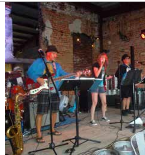
The Dogensteins perform at Intrinsic Smokehouse & Brewery in Garland.